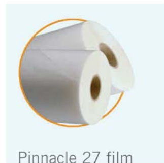
Pinnacle 27 film

High quality and crystal clear laminating film insures the finest results.