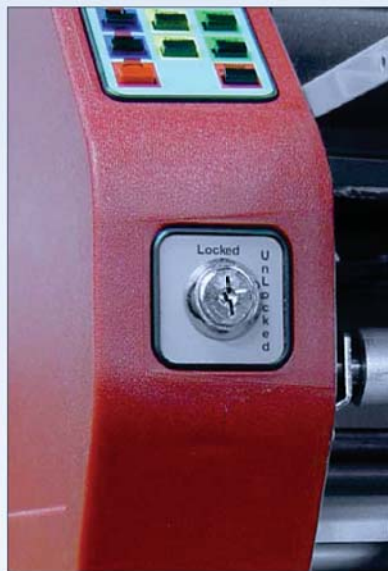
Key Switch Prevents Unauthorized Users