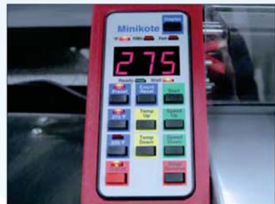
Touch Pad Controls