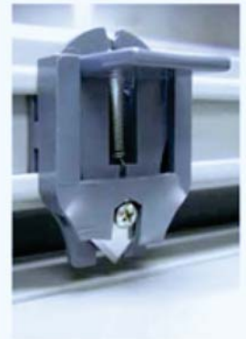
Cross cutter permits simple cutoff as the laminated material exits the rear