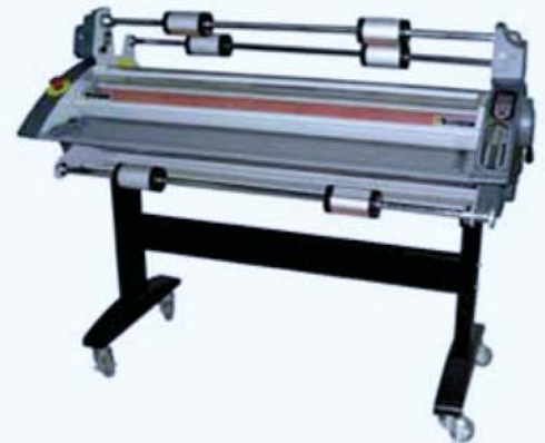
RSH-1151 45" Laminator

5 position lever adjusts the nip between the rollers while springs maintain even pressure during lamination.