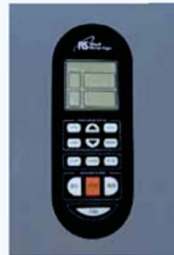
User friendly controls simplify operation