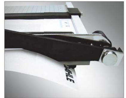
Spring action blade will return to the up position after trimming to reduce fatigue.