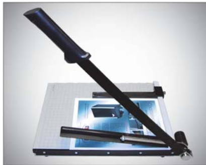
The automatic paper clamp securely holds your work in place and prevents paper shifting.