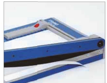
Ground self-sharpening cutting blade maintains a perfectly honed edge.