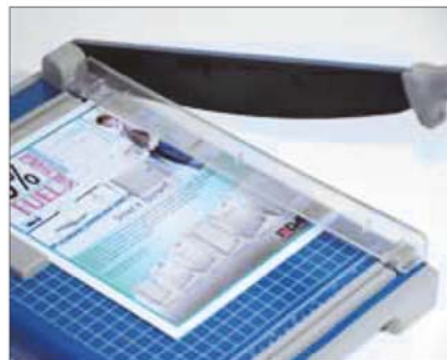
Protective guard keeps fingers safe and holds work securely when depressed