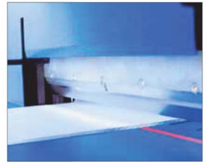
Ground Solingen steel blade cuts through up to 200 sheets of paper with ease.