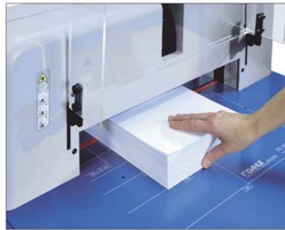
Automatic Cutting System provides a one step operation that clamps and cuts through the material with a single downward movement of the cutting handle