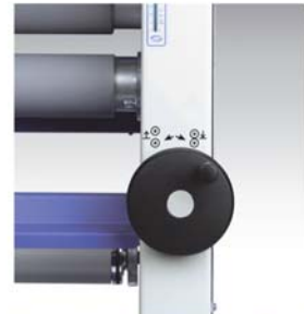
Manual nip adjustment with height gauge for precise operation.