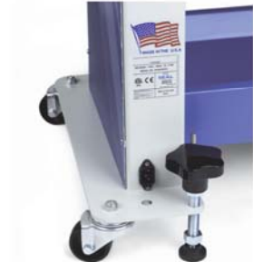
Heavy duty rear stabilizing feet.