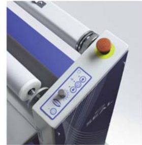
Ergonomic control panel for ease of use.

* Specifications may change without notice.