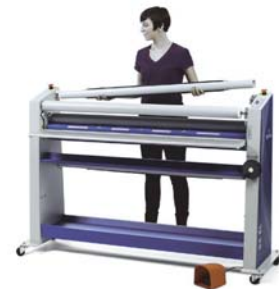
Light-weight auto grip shafts for user friendly webbing.